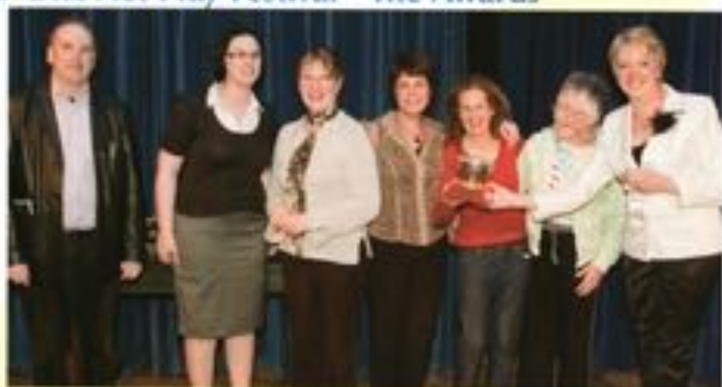
Northern Arts Rose Bowl for Best Play 'The Allotment' Rushen Players