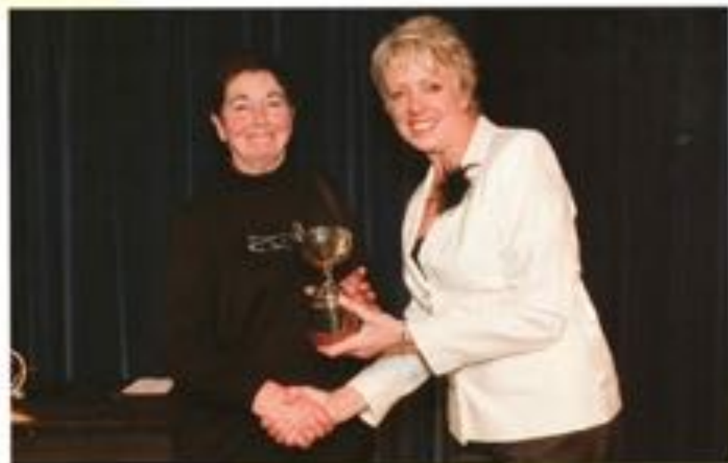
The John Bowring Trophy (Runner Up) 'Ruffian on the Stair' Rushen Players